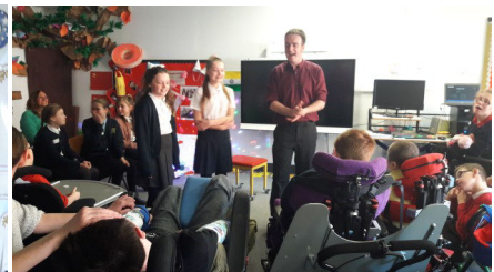
The girls meeting the Fountainsdale children